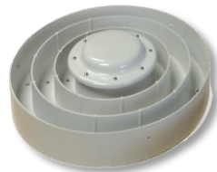
GNSS Choking Antenna