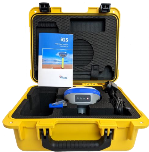
iG5 Complete Kit